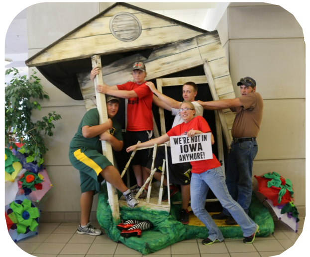
2015 Iowa Envirothon Champions:

Executive Director, Conservation Districts of Iowa