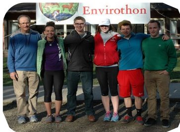
Wildlife Winner Decorah Brookies