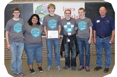
Aquatics Winner Marshalltown High School 1