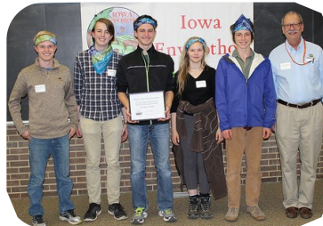
Forestry Winner Decorah Ospeys