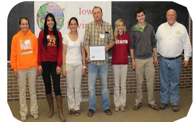
Soils Winner Des Moines FFA 2