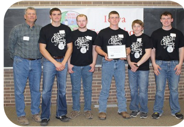
Runner-Up, Aquatics and Oral Presentation Winner Waverly-Shell Rock FFA 1